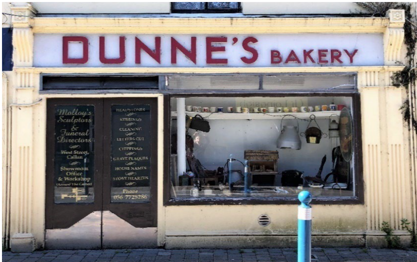
Figure 13 Dunne's Bakery, 8 Upr Bridge Street, Callan R95 H727 © Dee Maher Ring and Kilkenny County Council (2022).