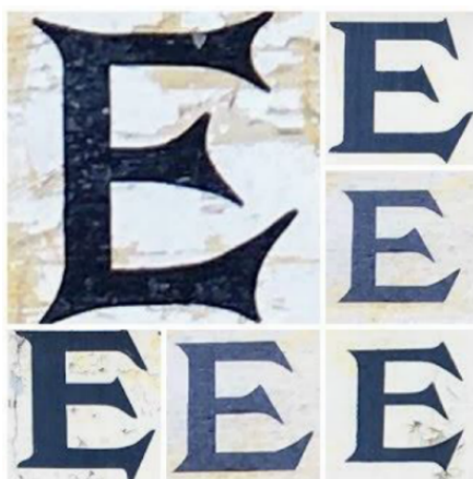
Figure 8 Lenehan, 10 Castlecomer Road, Eircode R95 N622 © Dee Maher Ring and Kilkenny County Council (2021).

The idiosyncratic nature of the vernacular letterforms was particularly visible in the hand painted exemplars. One case at Lenehan’s, 10 Castlecomer Road revealed six variations of the uppercase letter E (Figure 8). Nonetheless, all letterforms exist on one building and, to the best of my current knowledge, are the work of the late artisan Eoin Quigley.