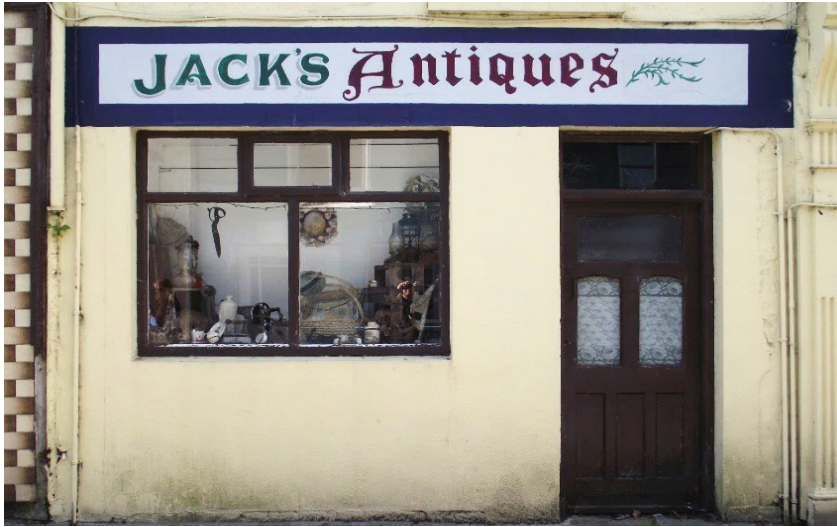
Figure 12 Jack's Antiques, 7 Upr Bridge Street, Callan R95 X061 © Dee Maher Ring and Kilkenny County Council (2022).