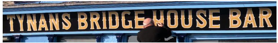
Figure 4 Tynan's Bridge House Bar, 2 John's Bridge, Eircode R95 WY88 © Dee Maher Ring (2022).