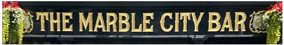
Figure 9 The Marble City Bar, 66 High Street, Eircode R95 TY24 © Dee Maher Ring and Kilkenny County Council (2021).

Manufacturers of original, applied stock letterforms were challenging to discern. Nonetheless, the atypical, Victorian cast-iron letterforms on Andrew Ryan's pub of Friary Street (Figure 10) can be attributed to Walter MacFarlane & Co's Saracen Foundry, Glasgow, Scotland (Bartram, 1978).