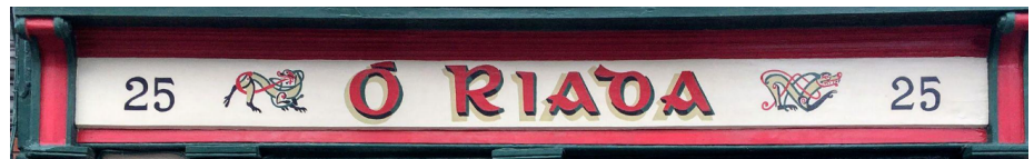
Figure 5 O' Riada, 25 Parliament Street, Eircode R95 CH79

Hand painted fascia signs accounted for 10 of the 53 shopfronts surveyed, with one instance in the Irish language ("as Gaeilge") at O' Riada, 25 Parliament Street. Moreover, O' Riada was one of only three instances of Chló Gaelach 19 signs surveyed (Figure 5).