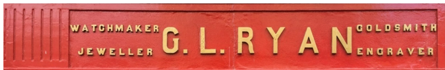
Figure 7 GL Ryan, 71 High Street, Eircode R95 AX54 © Dee Maher Ring and Kilkenny County Council (2021).

The idiosyncratic nature of the vernacular letterforms was particularly visible in the hand painted exemplars. One case at Lenehan’s, 10 Castlecomer Road revealed six variations of the uppercase letter E (Figure 8). Nonetheless, all letterforms exist on one building and, to the best of my current knowledge, are the work of the late artisan Eoin Quigley.