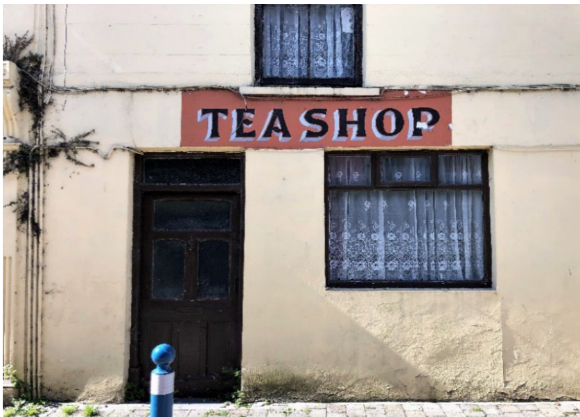
Figure 14 Tea Shop, 9 Upr Bridge Street, Callan R95 Y2D0 © Dee Maher Ring and Kilkenny County Council (2022).